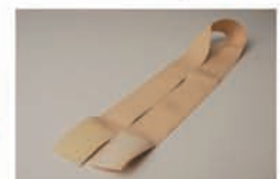
Tourniquet with Velcro