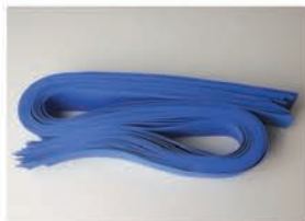
Each strip cut to 18" length, 250 such pieces packed in a polybag.