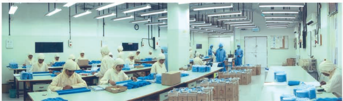
Inspection and packing in Clean Room