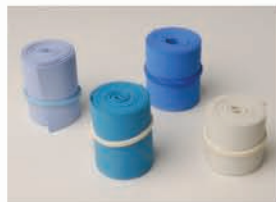
Each strip cut to 18" length, rolled and banded with a latex / latex-free band.