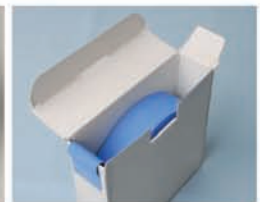
25 strips rolled on a core having perforation at 18" length.